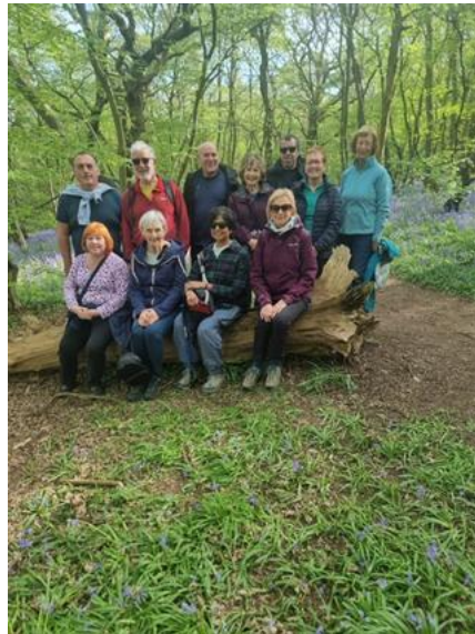
U3A walkers enjoyed seeing bluebells in Beckney Woods on 10 April